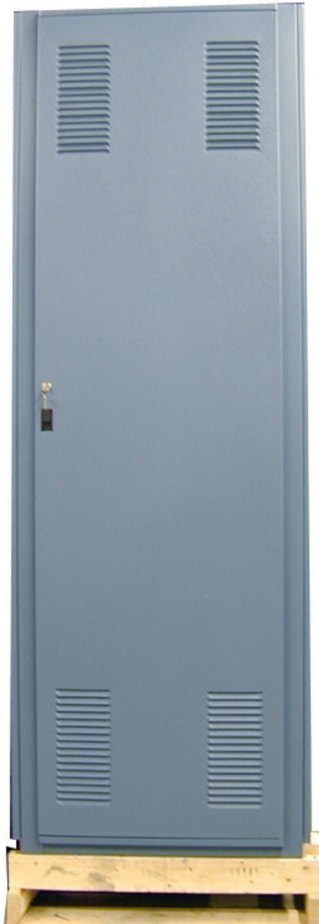
7' Collocation Cabinet (Shown with louvered door and lock)