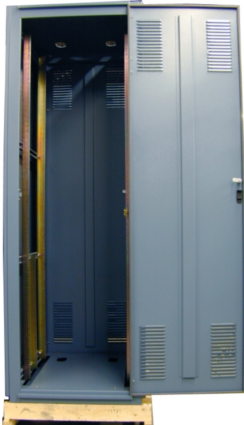
7' Collocation Cabinet (Shown with doors, side panels and internal mounting rails)